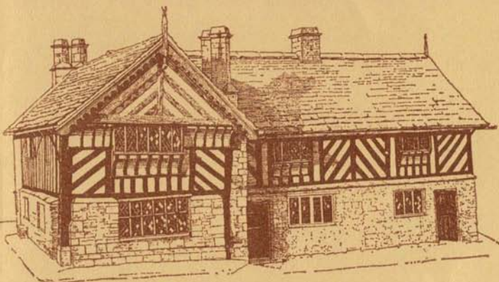
One of Sheffield City Museums